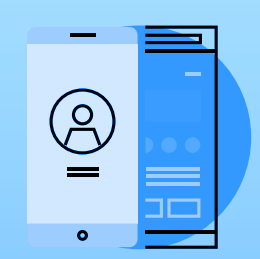
Empower employees to work from any device and location securely

Creating a workplace that enables working from any device and location securely and reliably requires an IT and business transformation.